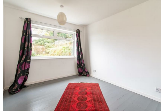
Lounge Dining Room 19'8 x 11'10 (5.99m x 3.61m)